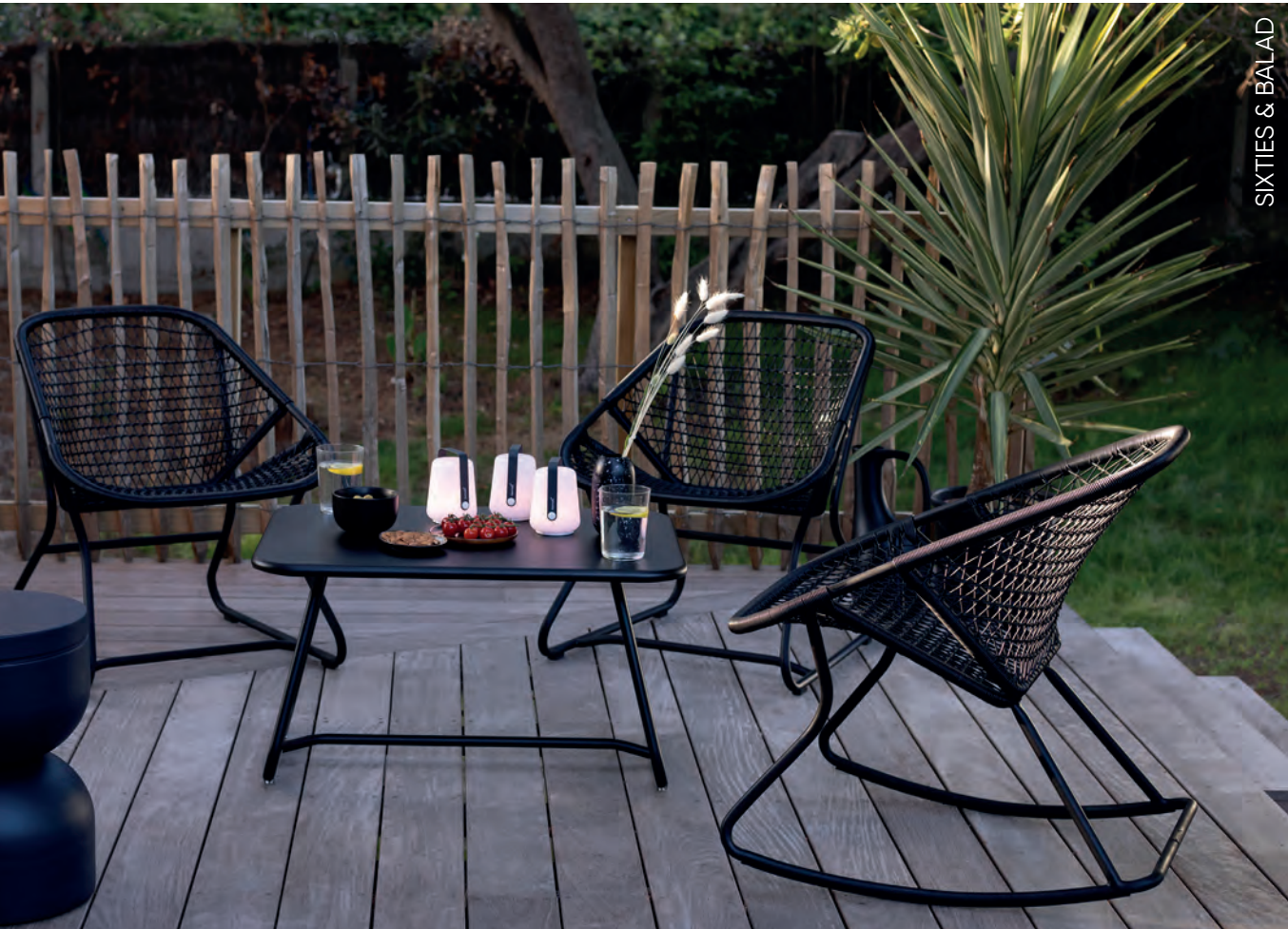
SIXTIES & BALAD